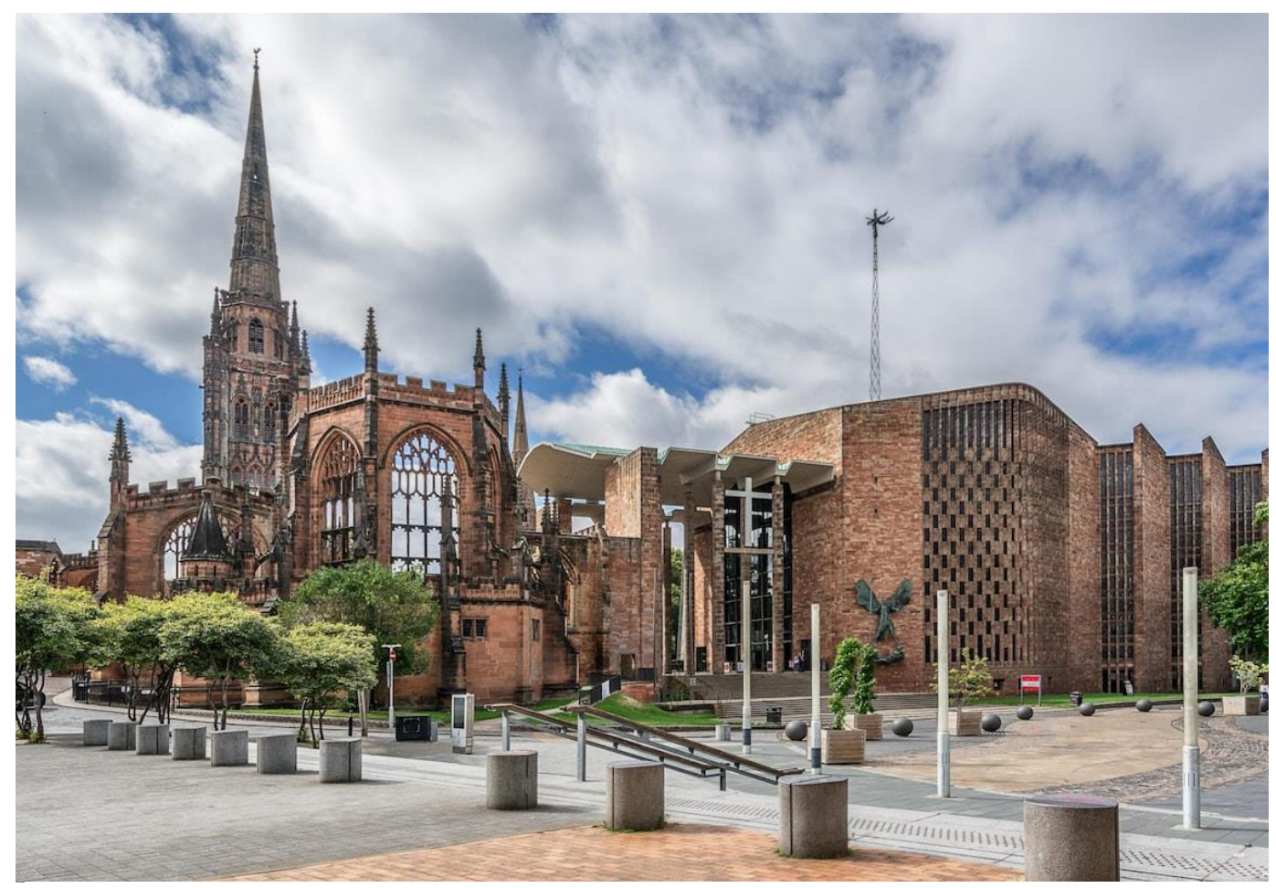
"When I saw him, I fell at his feet as though dead. Then he placed his right hand on me and said: "Do not be afraid. I am the First and the Last. I am the Living One; I was dead, and now look, I am alive for ever and ever! And I hold the keys of death and Hades." Revelation 1:17-18 NIV